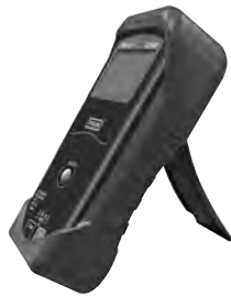
P920-100 comes standard with tilt stand protective boot

The Totaline P920-100 EZ Multimeter switches automatically between AC and DC Voltage as well as resistance measurements. No more guessing what range to switch your meter to! The Totaline P920-100 EZ Multimeter does it automatically.