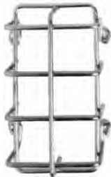
GRD10-1R Wire Guard