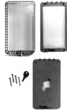
GRD10A-609 Rectangular Clear Plastic Guard