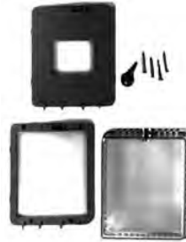
GRD10A-608 Large Clear Plastic Guard