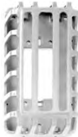
GRD10A-601 Cast Aluminum Guard